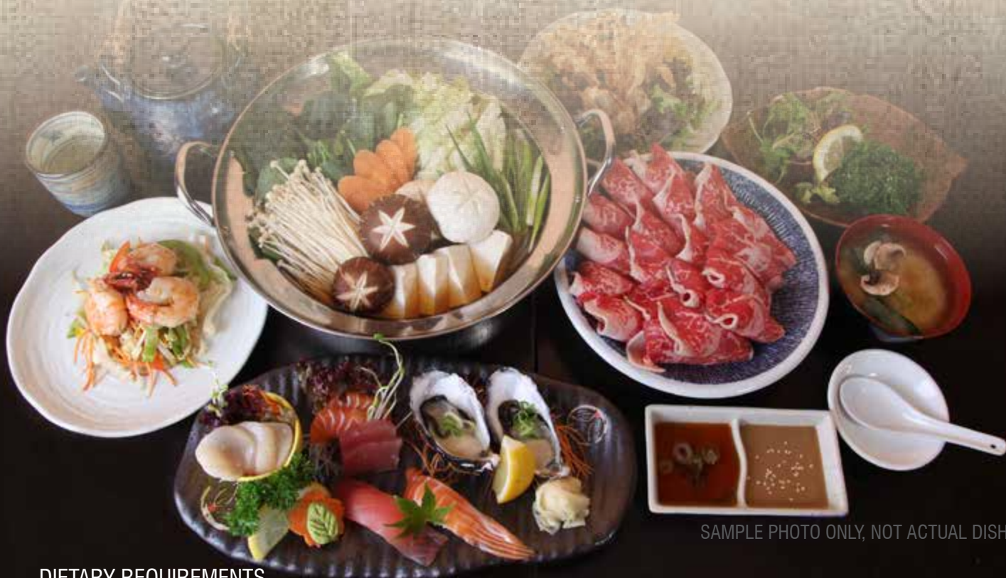
SAMPLE PHOTO ONLY, NOT ACTUAL DISHES